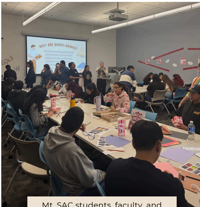
Mt. SAC students, faculty, and staff enjoying the crafts, games, and snacks