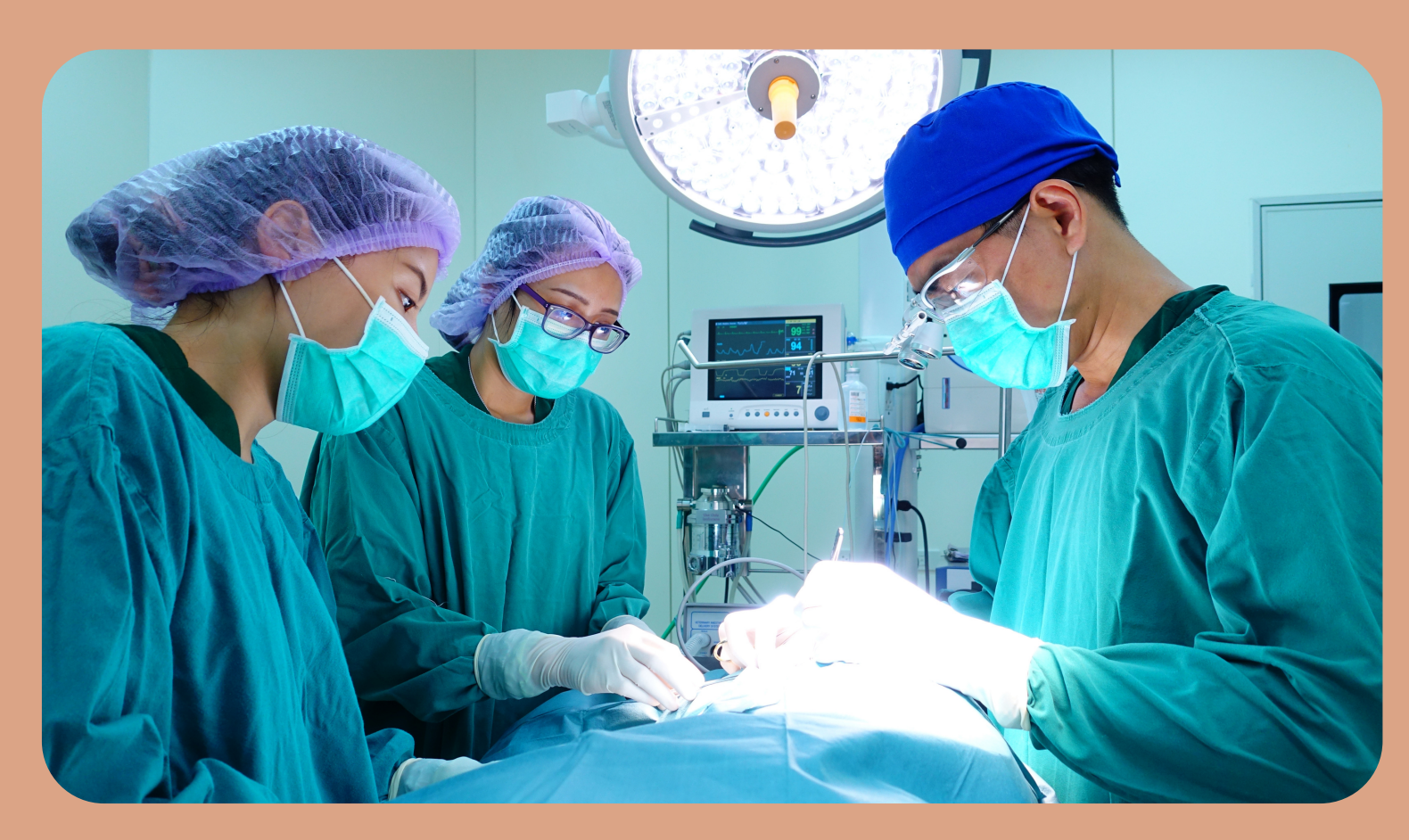
Salary*: $99,250 per year