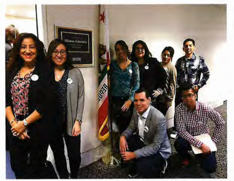
Policy Seminar; ACES students visiting the Capitol meeting with Senator Dianne Feinstein, March 2016