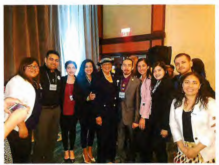
Policy Seminar; ACES students visiting the Capitol meeting with Representative Gwen Moore, March 2017