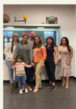
Mt. SAC Planetarium, Fall 2022