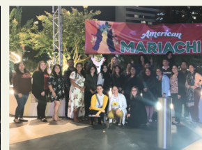
American Mariachi, Fall 2019