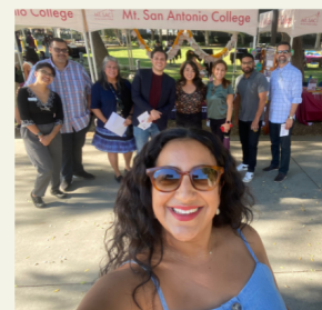
Celebrando Nuestra Excelencia, Fall 2022