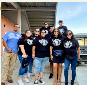
Drive-thru Nuestra Celebracion, Spring 2021