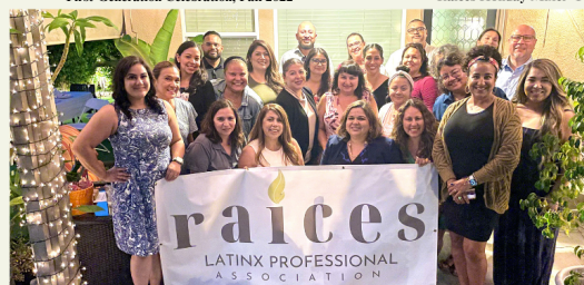
Raices Planning Summit, Fall 2023