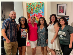
Raices Planning Summit, Fall 2022