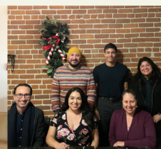
Raices Holiday Mixer- Fall 2022