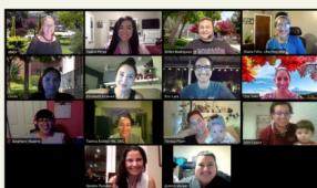
Raices Community Check-in (COVID), Spring 2020