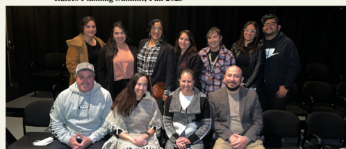
Mt. SAC La Gringa, Fall 2022