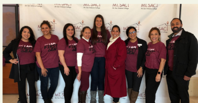
First-Generation Celebration, Fall 2022