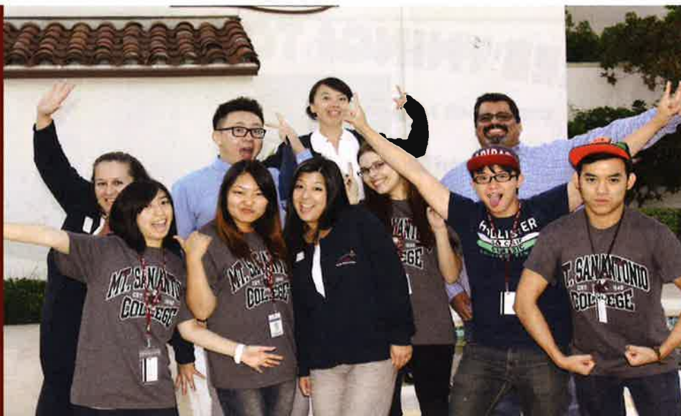
Fall 2014 International Student Welcome Reception

For more info, please contact the Learning Assistance Center .