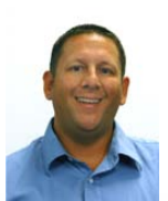
Lawrence Silva Reading Library & Learning Resources