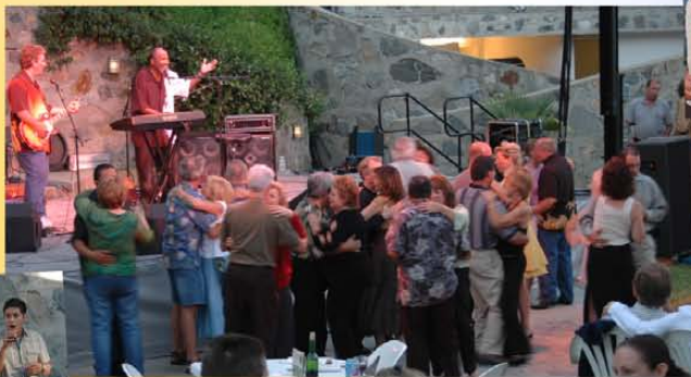
◀ Guest performance by Fermata Nowhere.