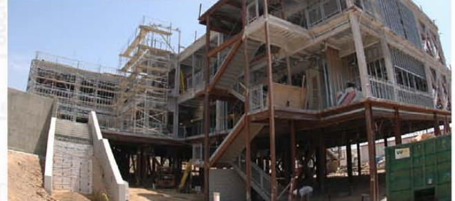
▲ The new Science Labs Center will boast state-of-the-art amenities to facilitate innovative learning.