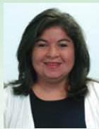
Susana Cevallos-Castaneda Reading Library & Learning Resources