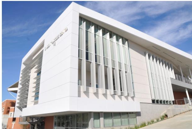
(Mt. SAC Student Success Center)