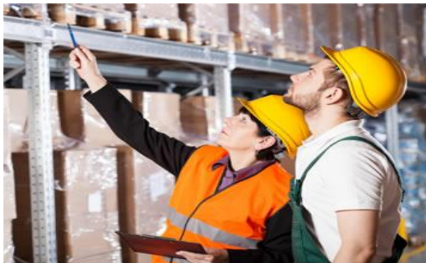
Industry Safety Standards