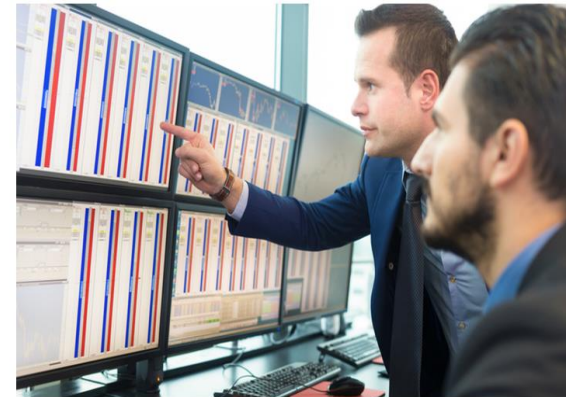
Associate Degree in Technology & Logistics