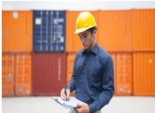
Certificate of Achievement in Technology & Logistics