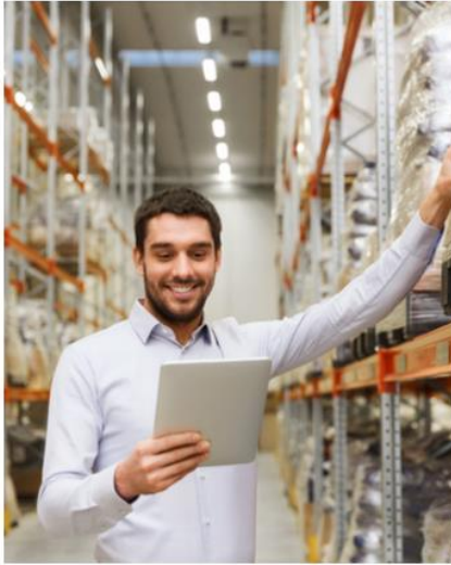
Logistics Material Handling