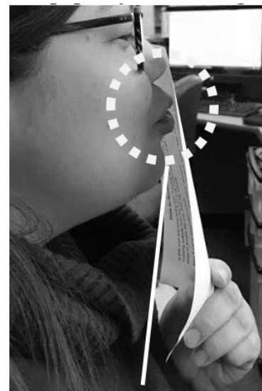
Lips reaching out and "kissing" paper