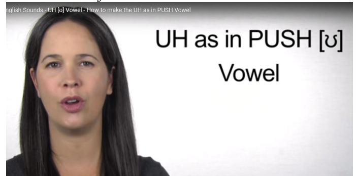
ōō sound like “book”

You learned how to make this vowel sound in SDLA P03 ă/ō. For review, to make the ă sound, we open our mouth sideways and allow the jaw to open halfway. The tongue stays low and behind the teeth.