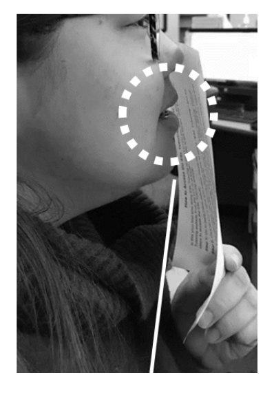
Lips relaxed, not touching or reaching out to the paper

When you make the oo sound, the lips are more relaxed and don't touch or reach the paper. The tongue is back and behind the teeth.