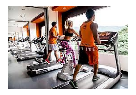
___ Go to the gym