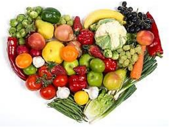
____ Eat healthy