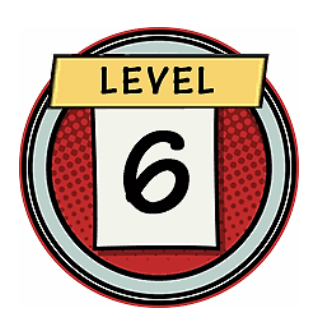
Finish Level 6