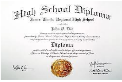
____ Get a High School Diploma

Look at the pictures. Prioritize each goal below. Type "1" for the most important goal. Type "9" for the least important goal to you.