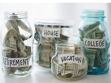
_ Save money