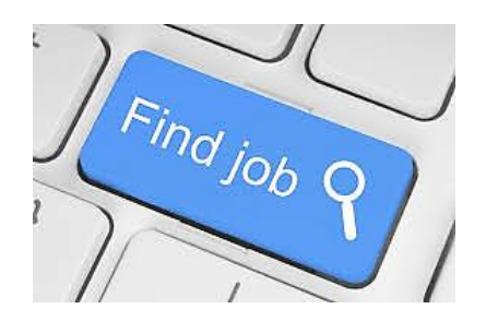
__ Find a job