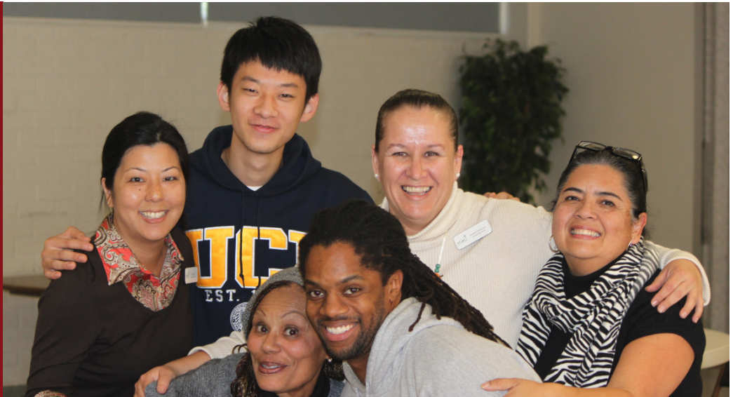
Fall 2013 Halloween Fest

For more info, please contact the Learning Assistance Center .