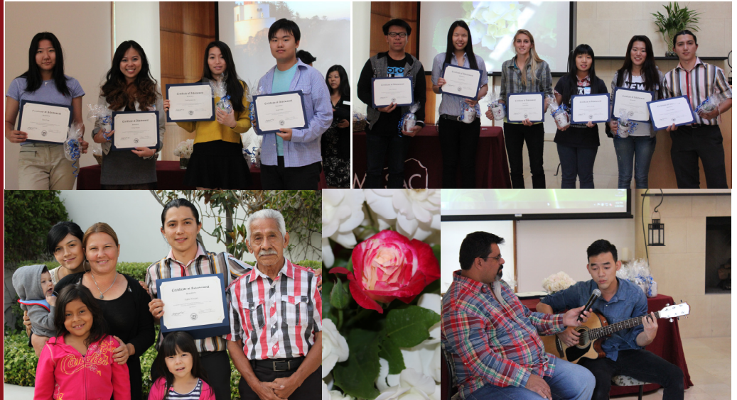
Spring 2014 Recognition Ceremony

For more info, please contact the Learning Assistance Center .