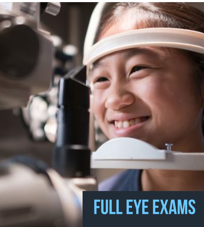
FULL EYE EXAMS

SEPTEMBER 26TH OCTOBER 10TH NOVEMBER 21ST 8:50AM - 2:20PM