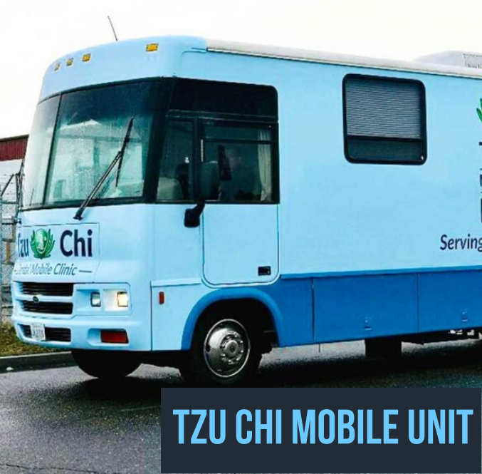
TZU CHI MOBILE UNIT