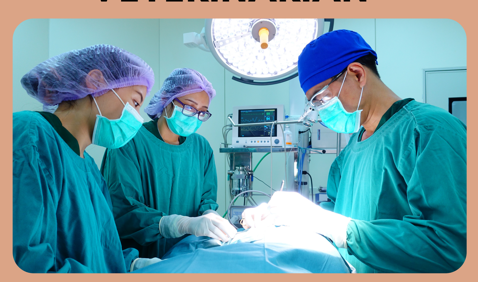
Salary*: $99,250 per year