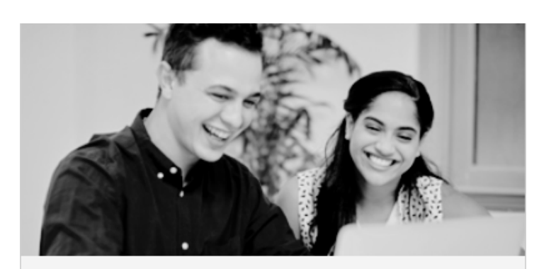
Distance Learning (Online) & Canvas Navigation