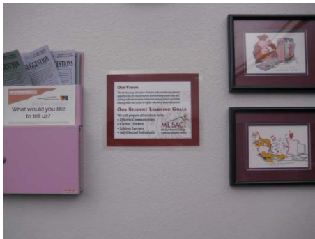
Located in our Open Lab