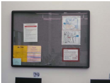
Located in our Smart Lab