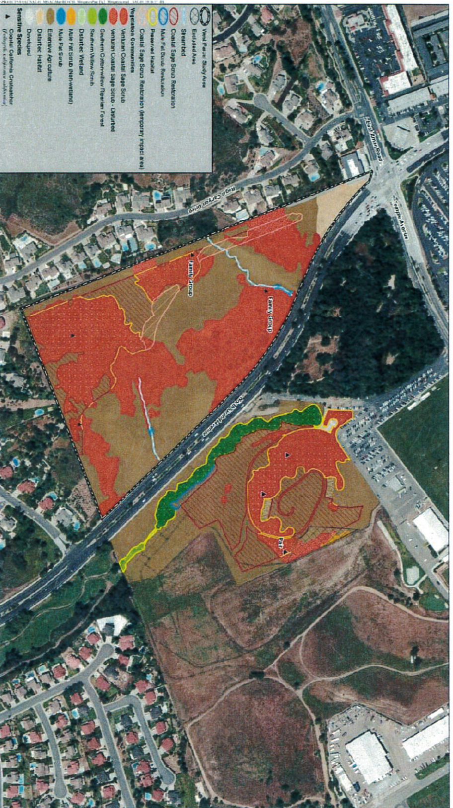
Exhibit A: Draft Mitigation Site