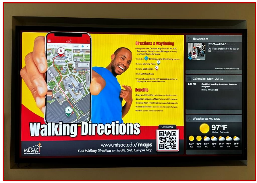
Campus Wayfinding Signage