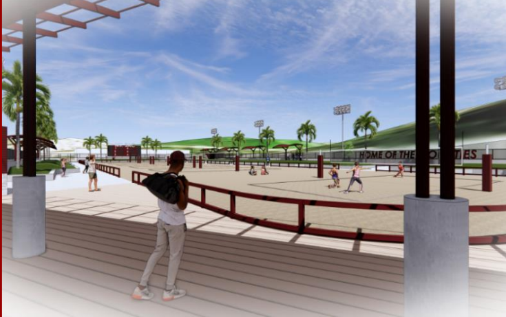
Conceptual rendering of Wildlife Sanctuary