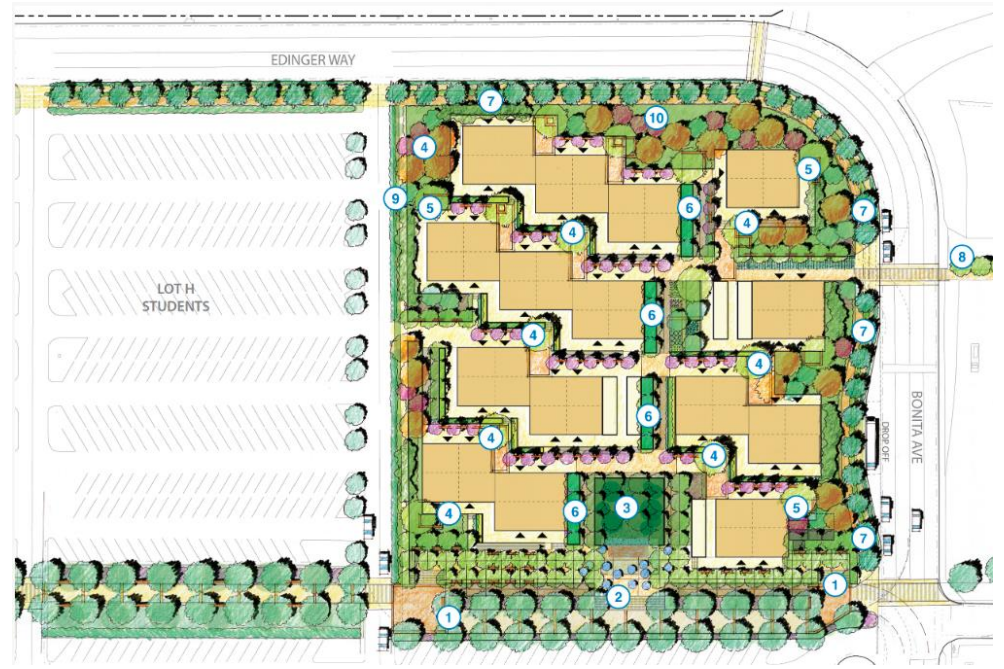
Phase 1 of Continuing Education and Instructional Village Project will provide up to 60 new classrooms at the northeast corner of Parking Lot H

Both the School of Continuing Education and Library Replacement projects continue at an accelerated rate. Both projects will be designed and built under the new 2022 codes, with a focus on energy efficiency; they are proposed to be Net-Zero Energy facilities when combined with the campus-wide self-generation (solar) projects.