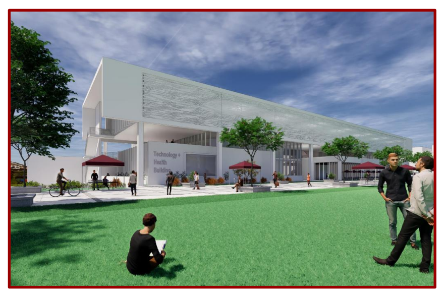
Conceptual rendering of Technology and Health Building

The first phase of the new Technology and Health Building began in June. Initial activities include the demolition of the old pool and adjacent athletics buildings, major grading, and utility infrastructure. Increment 2 will be submitted for public bidding in the Fall.