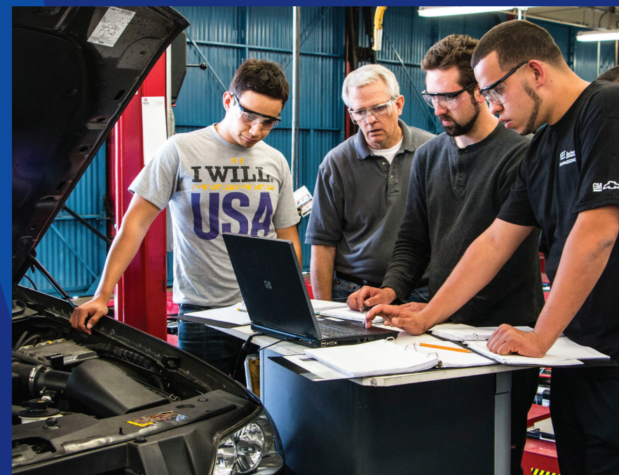
Entry-level employees learn and practice their skills by working with experienced Technicians.

Most employers prefer to hire employees who have completed a vocational or community college automotive technician program.