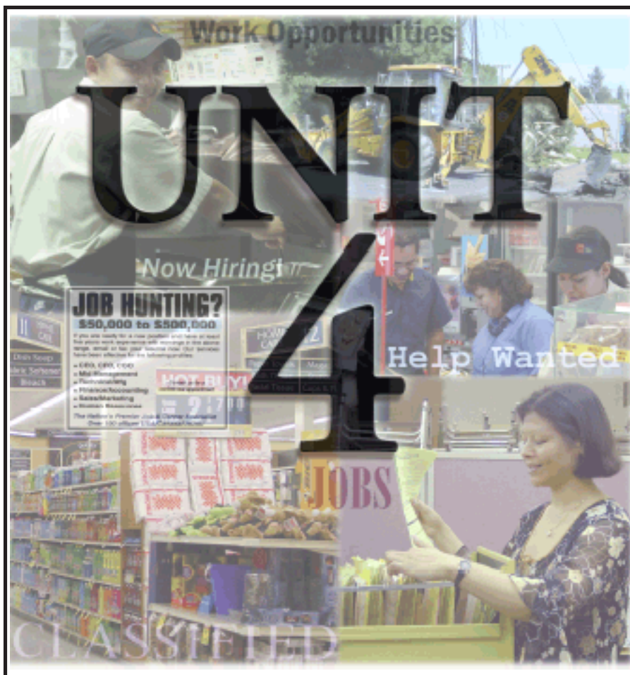
Table of Contents Level: Intermediate Low

Objective: Students will prepare for and participate in a job interview.