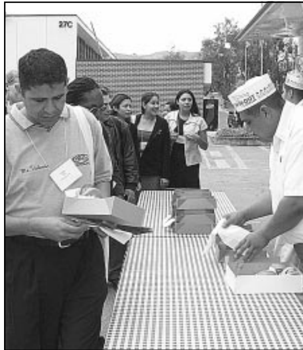
In-N-Out Burgers provided lunches for participants at this years Juniors Day.