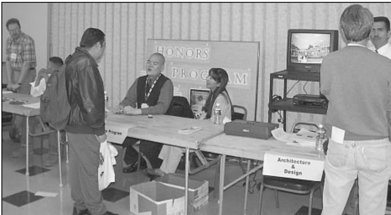
Mt. SAC Juniors Day also provided information for future students from different departments at Mt. SAC.