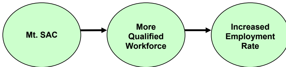
Figure 2 – Impact of Mt. SAC on the Labor Market

The fastest growing occupational areas in the San Gabriel Valley are in healthcare, education and research, and science and technology. These are all job areas in which Mt. SAC can help. Mt. SAC's programs in teaching, nursing, and computers provide new workers with the skills that they need in the increasingly competitive job market. In fact, a 2002 survey of Mt. SAC alumni found that the most frequent job area that Mt. SAC graduates work in is education 4 . In all areas, it was also found that a full 58% of those employed indicated that they are employed in an area that is related to their certificate/degree.